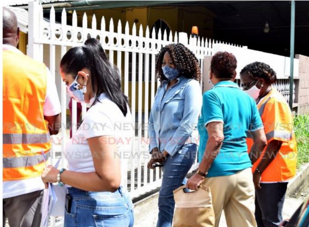
Social Development and Family Services Minister Donna Cox and staff from the Division of Aging enter the elderly-care home in Diego Martin on Sunday.